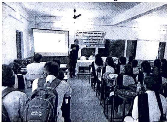
Attach Photo of Meeting No: 1